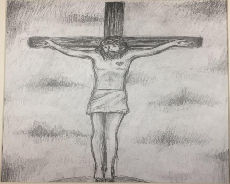
A drawing from Yuvajana Sakyam painting contest